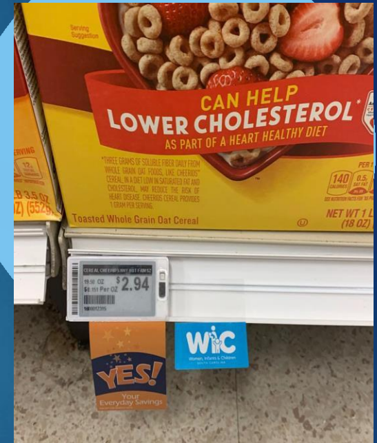
Wrong sequence because WIC hangs and is not a channel label