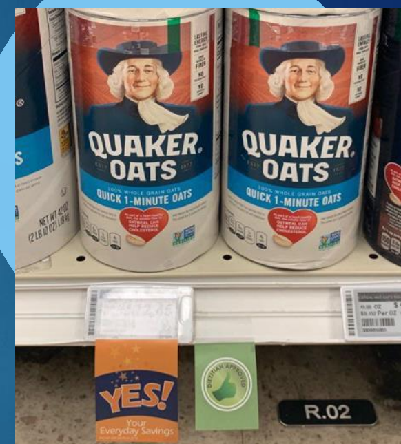
Correct sign sequence