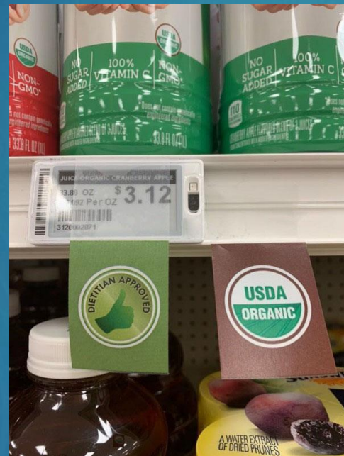
Correct label sequence because it is the only labels that apply