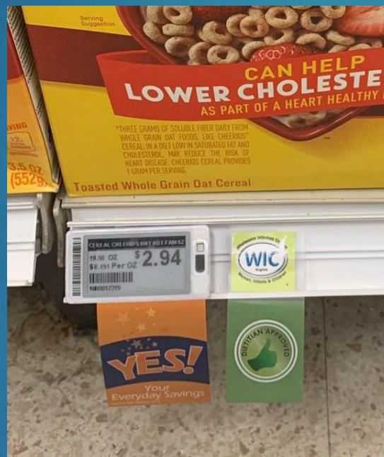
EXCEPTION: Correct because channel WIC is clearly visible