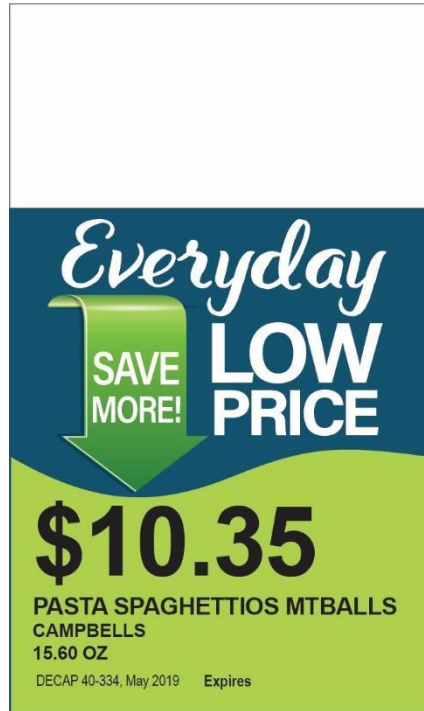
Everyday Low Price (in line)