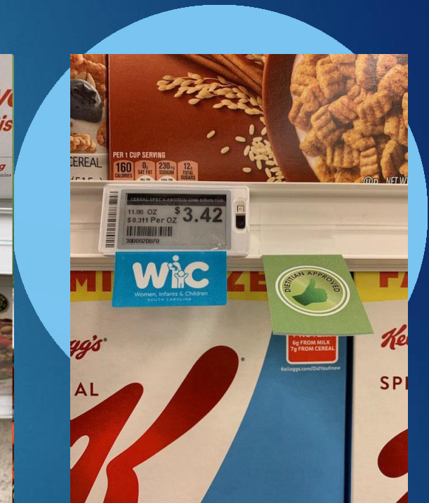
Correct label sequence because they are the only labels that apply