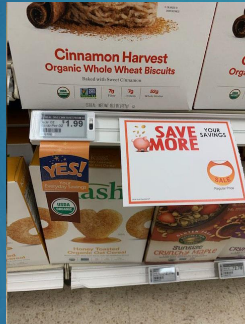
Too many labels. Do not hang labels from each other