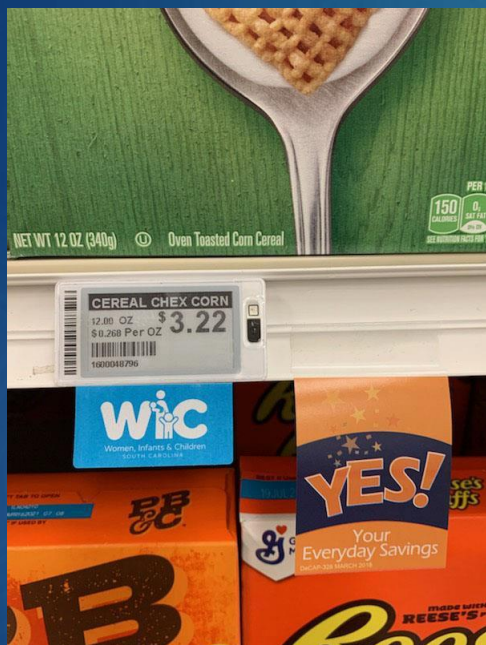
Correct label sequence