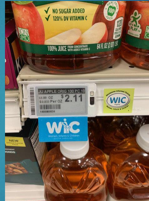
Do not use two WIC labels if available