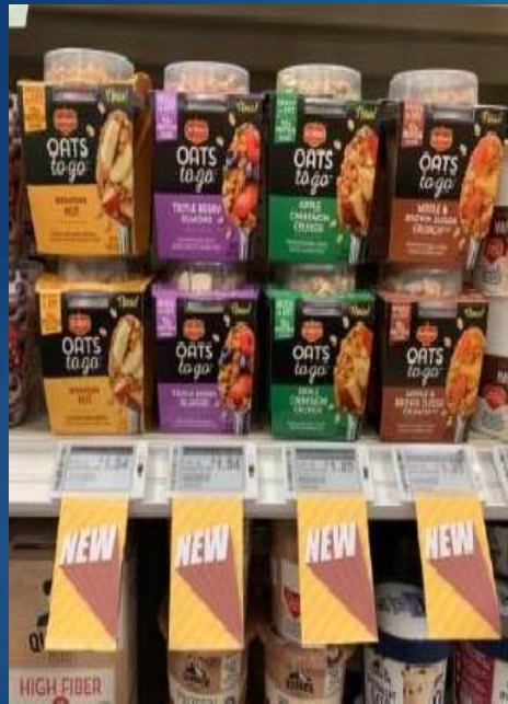
Correct label sequence