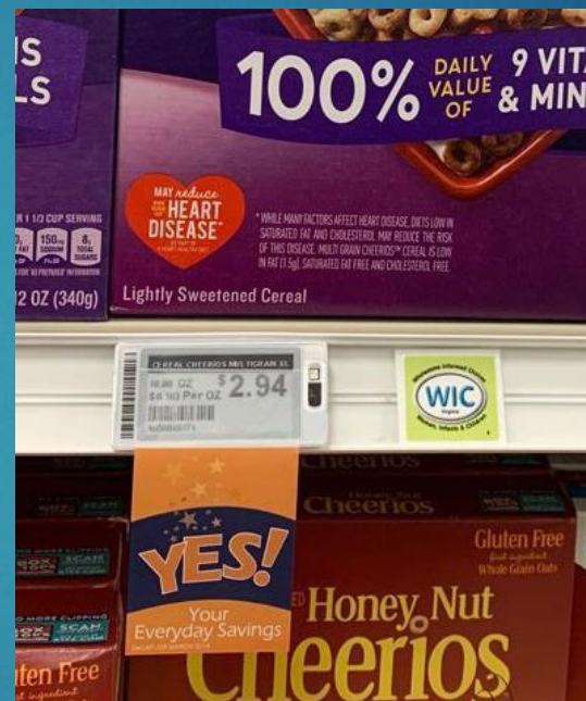
EXCEPTION: Correct because WIC is in the channel