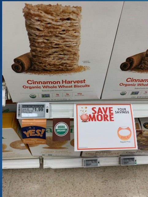
Too many labels