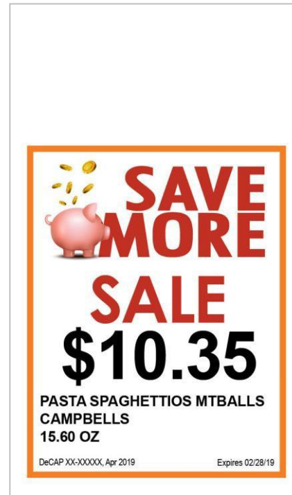
Save More (in line)