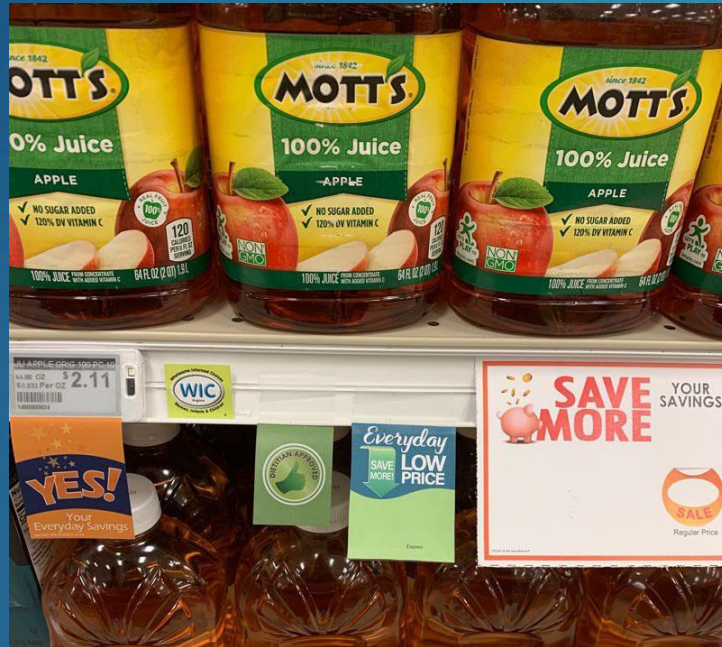
Too many labels