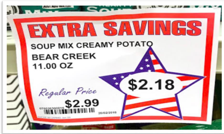
Promo End Cap