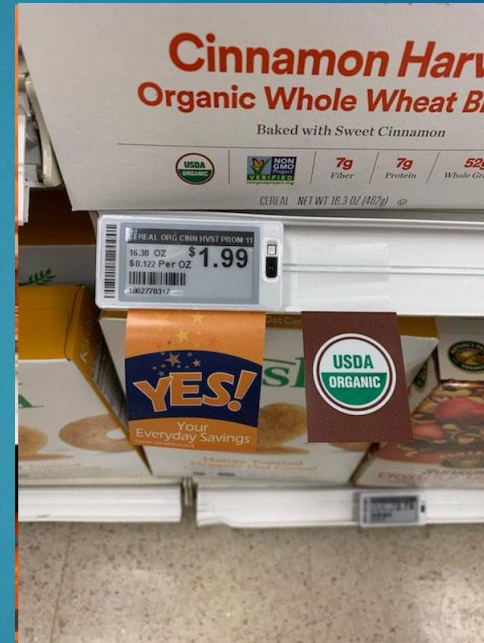
Correct label sequence because they are the only labels that apply