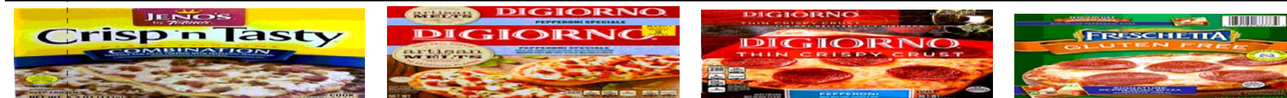
Shelf: 3 SINGLE SERVE