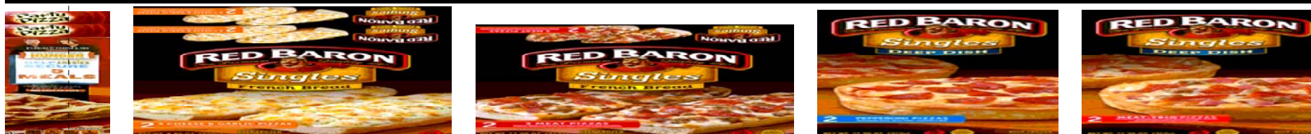
Shelf: 5 BASE SINGLE SERVE