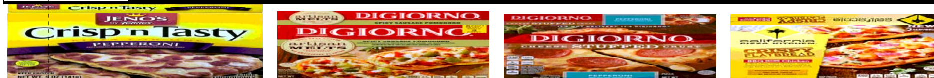
Shelf: 2 SINGLE SERVE