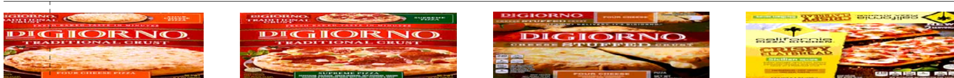
Shelf: 1 TOP SINGLE SERVE