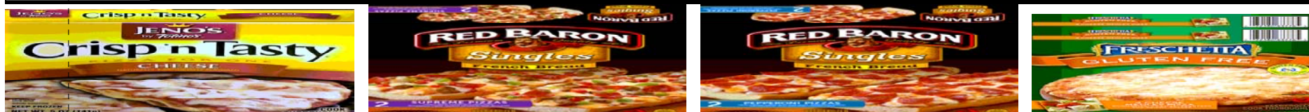
Shelf: 4 SINGLE SERVE