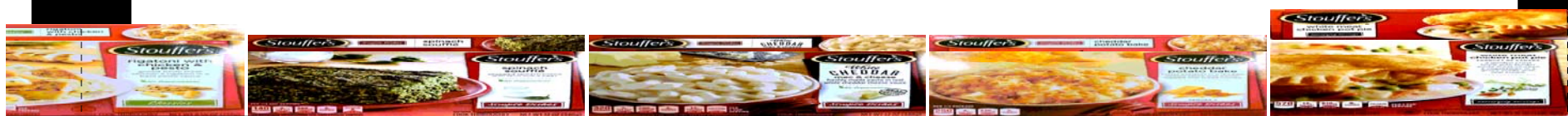
Shelf: SHELF 6 BASE SINGLE SERVE